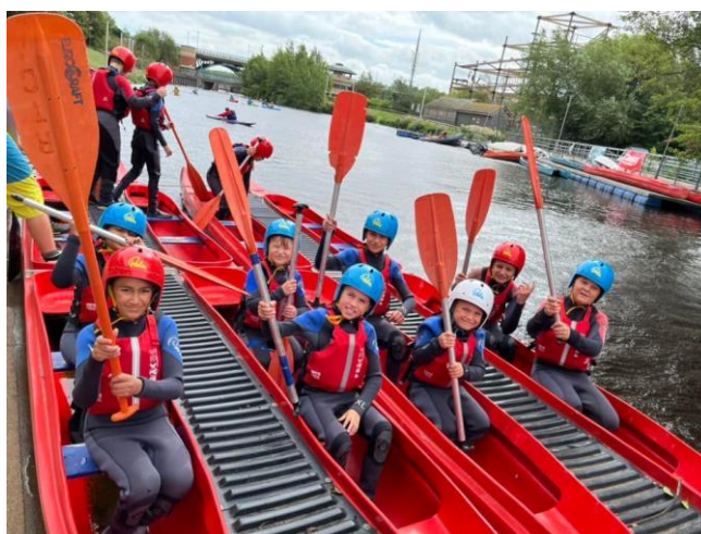
Children preparing for a canoeing activity at an Easter Fun and Food session.

62 During the May half term holiday, the Poverty Action Steering group gave £71,457 to fund 60 AAP projects, delivered across the county, and partners continue to offer wonderful creative projects, engaging children and young people in experiences and opportunities they wouldn't ordinarily be able to access.