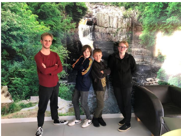
Members of the 3 Towns' Youth Panel

105 Jointly managed by the AAP and the Youth Panel, the fund awards grants between £200 and £500 to organisations for projects for children and young people up to age 19.